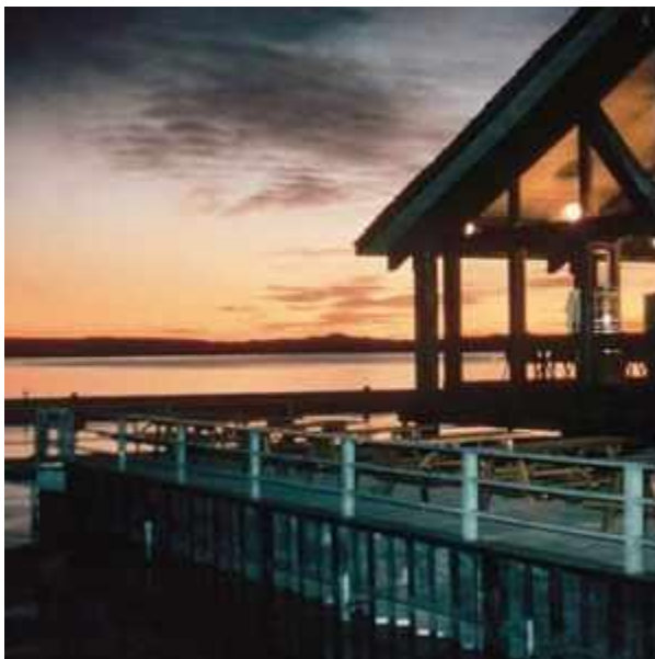
GRANT VILLAGE - YELLOWSTONE NATIONAL PARK