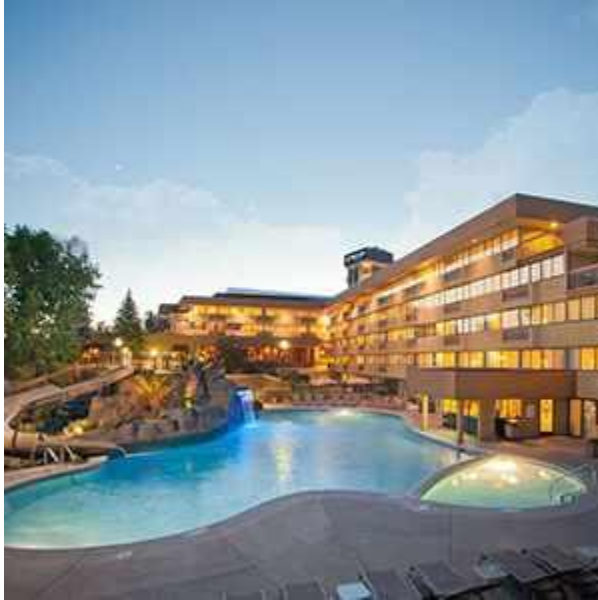
THE CENTENNIAL HOTEL SPOKANE