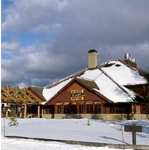
OLD FAITHFUL SNOW LODGE - YELLOWSTONE NATIONAL PARK